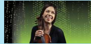
TESSA LARK HAYDN'S THE CLOCK Sat Oct 21, 7:30pm Sun Oct 22, 2:30pm