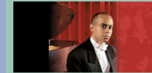
STEWART GOODYEAR BEETHOVEN'S EMPEROR Sat Apr 20, 7:30pm Sun Apr 21, 2:30pm