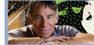
FROM GODSPELL TO WICKED AND BEYOND! Sat Oct 28, 7:30pm