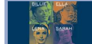
CARMEN BRADFORD FIRST LADIES OF SONG Sat Mar 9, 7:30pm