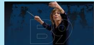
BEETHOVEN'S NINTH Sat May 11, 7:30pm Sun May 12, 2:30pm