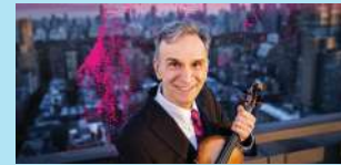
GIL SHAHAM PICTURES AT AN EXHIBITION Sat Sep 23, 7:00pm