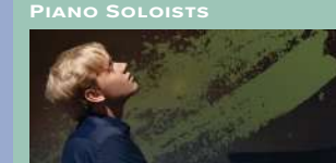
ALEXANDER MALOFEEV RACHMANINOFF PIANO No. 3 Sat Nov 4, 7:30pm