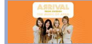
THE MUSIC OF ABBA Fri Nov 17, 7:30pm