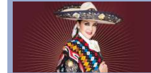
AIDA CUEVAS Sat Oct 14, 7:30pm