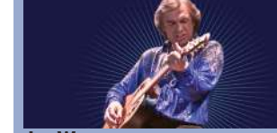
JAY WHITE MUSIC OF NEIL DIAMOND Sat Nov 18, 7:30pm