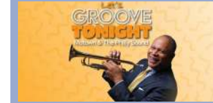
MOTOWN & THE PHILLY SOUND Sat Jan 20, 7:30pm