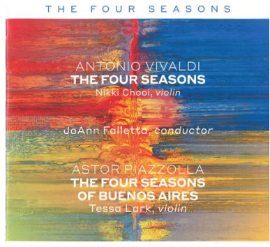
BUFFALO PHILHARMONIC ORCHESTRA